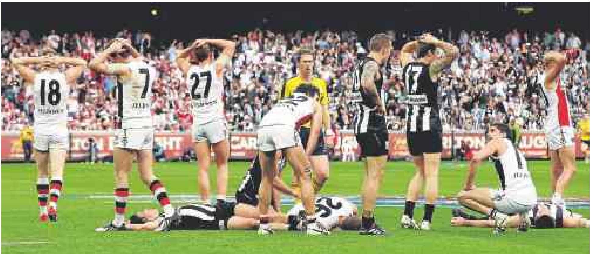
Shock and awe . . . Collingwood and St Kilda players stand shellshocked after the drawn grand final of 2010.