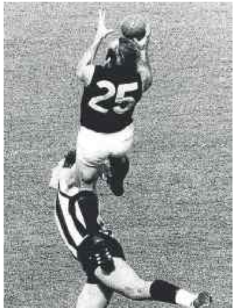
High flyer . . . Alex Jesaulenko at the height of his powers.

And while South Melbourne may be noticeably absent from