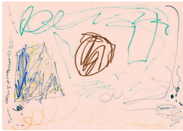
Olivia McMeeken, 3 years old, 2 stars