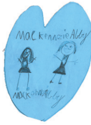
Mckenzie Clark, 6 years old, 2 stars

Hey, we still want to hear from you. If you've taken a great picture lately, why not send it to editor@sheppnews.com.au ?