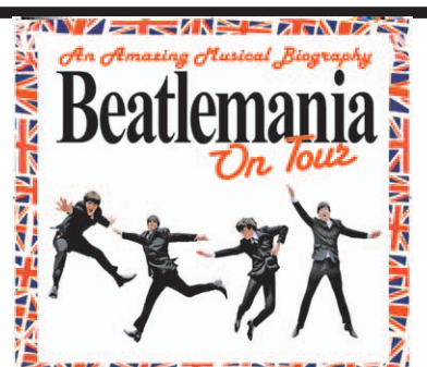
BEATLEMANIA - On Tour

Thursday, 28th February 7.30pm Adult: $49 Conc $39 Group (6+): $40 YP (U17): $17 Family (2+2): $120