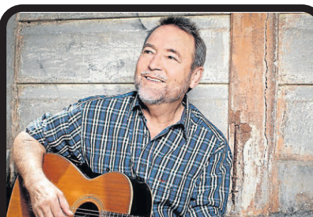
JOHN WILLIAMSON Big Red Tour 2013