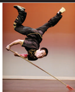
THE LEGEND OF KUNG FU

Friday, 15th February 8.00pm Adult: $54.00 Conc: $52.00 Group 10+: $52.00 YP(U14): $33.00 Credit Card Charges Apply