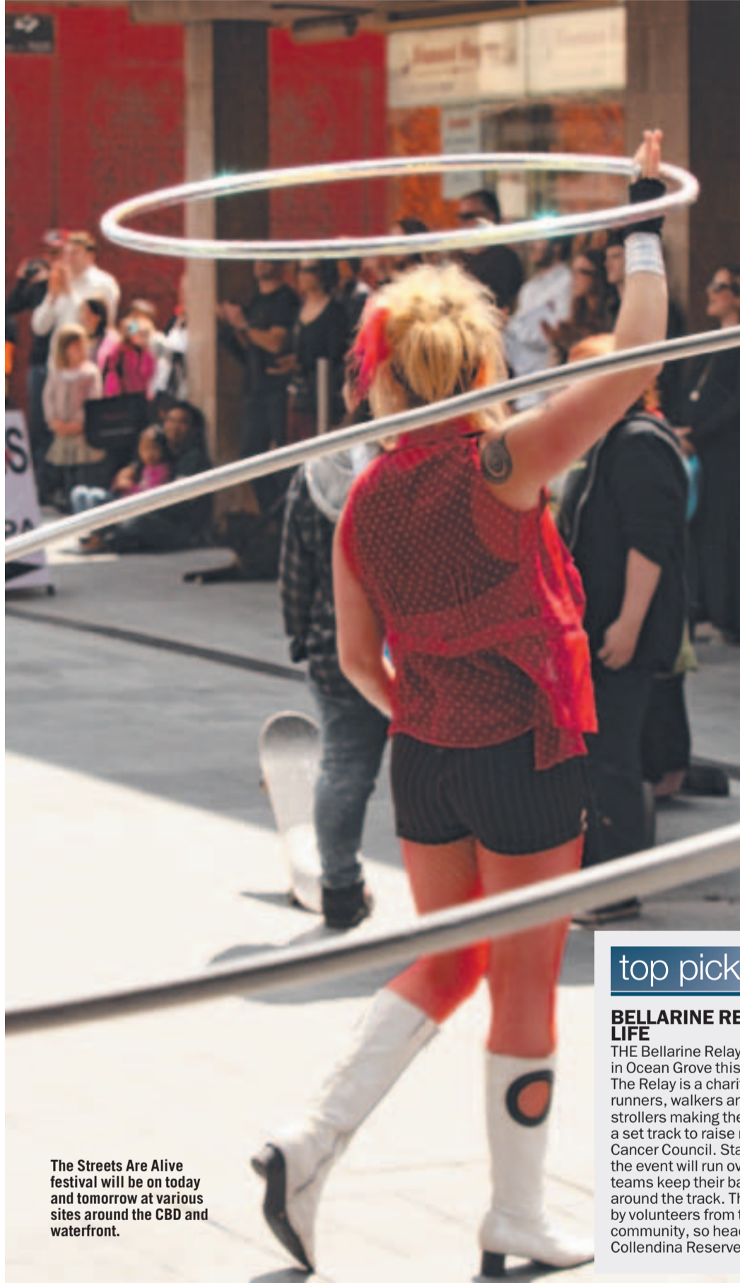
The Streets Are Alive festival will be on today and tomorrow at various sites around the CBD and waterfront.